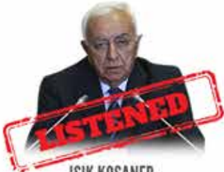
ISIK KOSANER He was CHOD 6 years before the "coup".