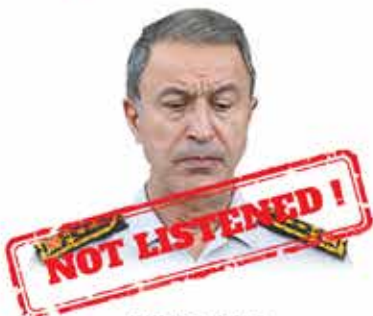
HULUSI AKAR CHOD during the "coup".

18 A state of emergency must be declared and prolonged as necessary in order to consolidate the current government's authority, to exercise far-reaching, unlimited discretionary power and pave the way for dictatorship and tyranny.