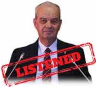
ILKER BASBUG He was CHOD 8 years before the "coup".