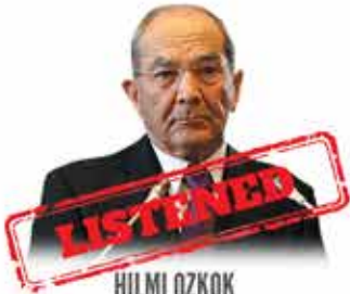
HILMI OZKOK He was CHOD 14 years before the "coup".